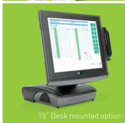
15" Desk mounted option