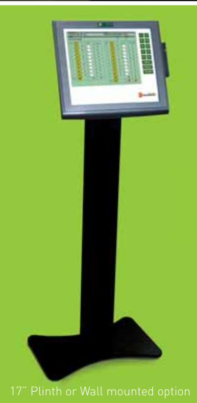
17" Plinth or Wall mounted option