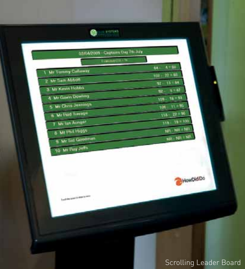
Scrolling Leader Board